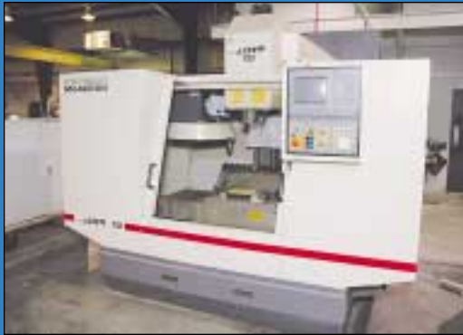
Cincinnati Milacron Model Arrow 750 Three-Axis CNC Vertical Machining Center

2249 Enterprise Drive – Richmond, Kentucky 40475 (30 Miles South of Lexington, KY off I-75)