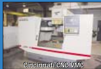
Cincinnati CNC VMC