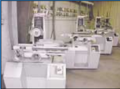
(4) 6" X 18" Harig 618 Hand Feed Surface Grinders