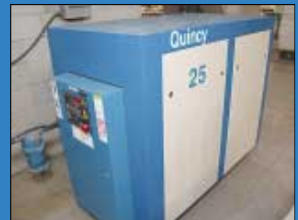
25 HP Quincy Model 25 Rotary Screw Cabinet Enclosed Air Compressor