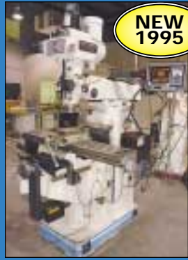
5 HP Kingston Model KNT-SV Two-Axis Proto Trak CNC Vertical Mill