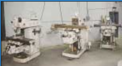
Partial View Dial Type Horizontal Mills