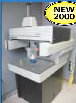
Renishaw Cyclone Three-Axis High Speed Scanning & Digitizing System