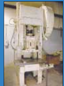
110 Ton Minister Model 70S-51/2 OBI Press