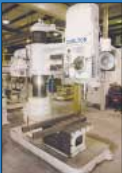
4' Arm X 13" Column Carlton Radial Arm Drill

Office Furniture and Computer Equipment Consisting of; Xerox 2510 Document Printer, Hewlett Packard Design Jet 430 Plus Plotter, Hewlett Packard Design Jet 750C Plotter, Panasonic KY-FL511 Laser Plain Paper Fax & Copier, Office Desks, Credenzas, File Cabinets, Folding Tables, Couch, Artificial Plants, Dell PC Computers, Drafting Tables, Smith Corona DX4600 Typewriter Lex Mark Printer, Dell P.C. Computer, Xerox Workcenter DX100 Copier, GBC Documino P300 Binding System, File Cabinets, Office Desks Chairs & Other Related Items