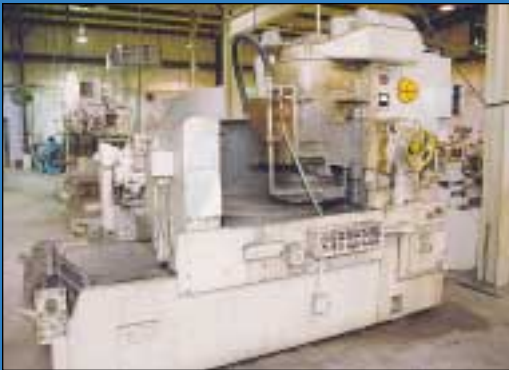
36" Blanchard No. 20K Rotary Surface Grinder

Also Features: Upcoming Sale Information, Printable Color Brochures, Printable Lot Listing Catalogs, Downloadable Forms, Complete Terms of Sale