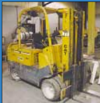
12,000 LB Caterpillar Model T120C LP Gas Solid Tire Lift Truck