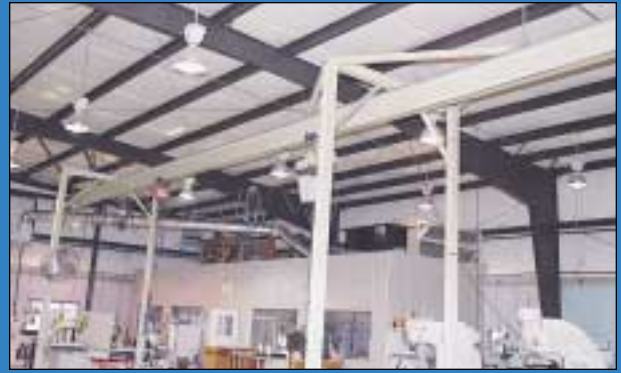
2 Ton X 60' Long Free-Standing Monorail Crane System

The Economic Stimulus Package recently passed by congress & signed into law allows a significant write off this year on used equipment purchases.