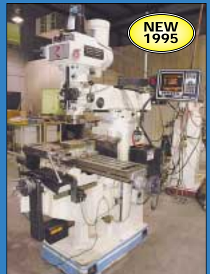
5 HP Kingston Model KNT-SV Two-Axis Proto Trak CNC Vertical Mill