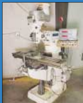
(2) 2 HP Bridgeport Variable Speed Vertical Mills