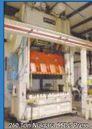
260 Ton Niagara SSSC Press