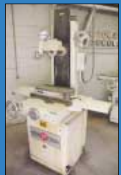
(2) 6" X 18" Parker Majestic Hand Feed Surface Grinders