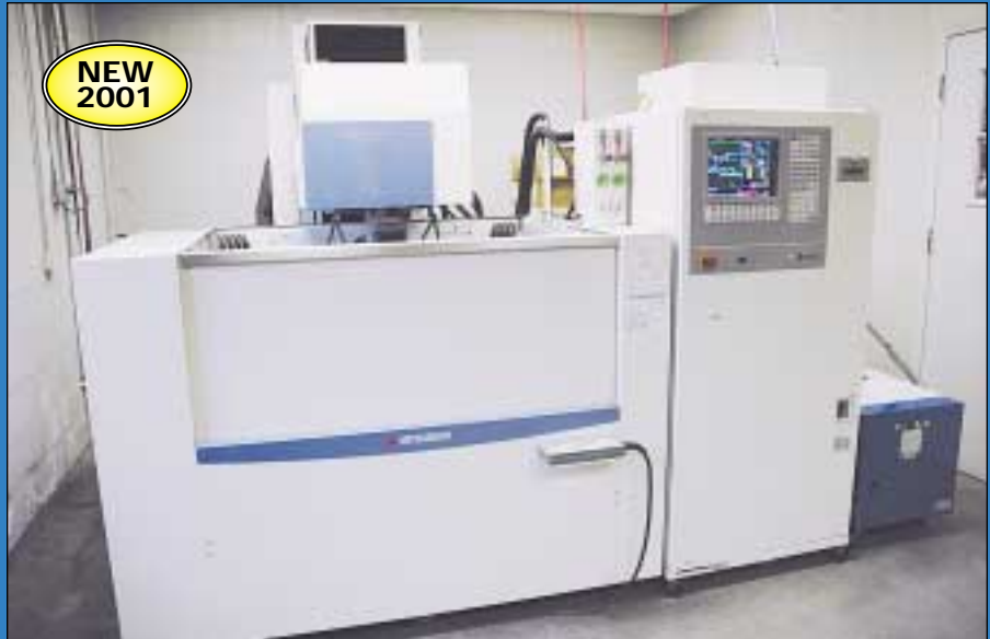
Mitsubishi Model FX-30K CNC Wire EDM