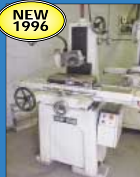
6" X 18" Sharp Model SG-618 Hand Feed Surface Grinder