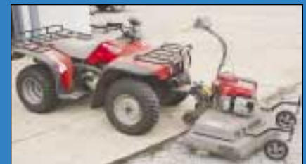
Honda Four Trax Model 300 4X4 All Terrain Vehicle