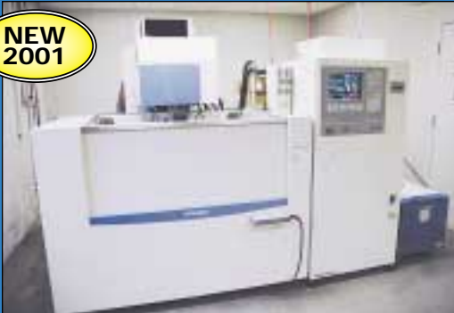
Mitsubishi Model FX-30K CNC Wire EDM

Featuring: Mitsubishi Model FX-30K Wire EDM (New 2001), Mitsubishi DWC-110HA Wire EDM, Cincinnati Milacron Arrow 750 CNC Vertical Machining Center, CNC & Manual Vertical & Horizontal Mills, Surface Grinders, Lathes, Radial Arm Drills, Presses & Feed Equipment, Welders, Air Compressors, Lift Trucks, Inspection Equipment & Machine Accessories