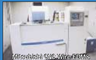
Mitsubishi CNC Wire EDM's

2020 DUNLAP ST., CINCINNATI, OHIO 45214 PHONE (513) 241-9701 / FAX (513) 241-6760 INTERNET: cia-auction.com