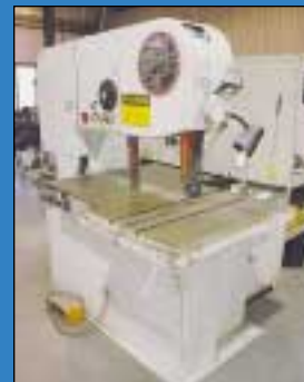
36" Doall Model 3612-2H Vertical Band Saw