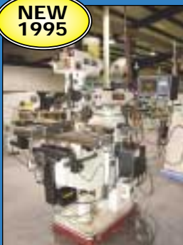
3 HP Ultima Model 3VKH Two-Axis Proto-Trak CNC Variable Speed Vertical Mill