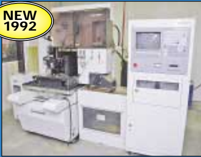
Mitsubishi Model DWC- 110HA CNC Wire EDM