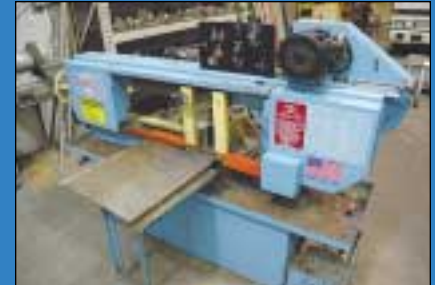
9" X 16" DoAll Model C-916M Horizontal Band Saw