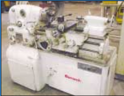
10" X 20" Monarch Model EE Toolroom Lathe