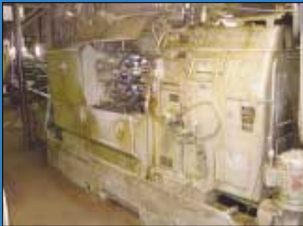
1-5/8" Acme-Gridley Model RBN-8 Eight-Spindle Automatic Bar Machine