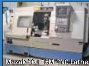
Mazak SOT 15M CNC Lathe

2020 DUNLAP ST., CINCINNATI, OHIO 45214 PHONE (513) 241-9701 / FAX (513) 241-6760 INTERNET: cia-auction.com