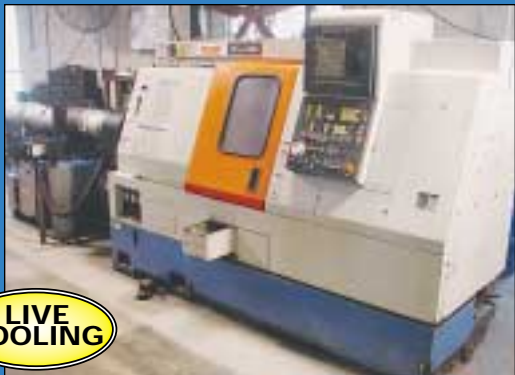
Mazak Super Quick Turn Model 10MS Three-Axis Slant Bed CNC Turning Center