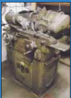
6" X 18" Myford Cylindrical Grinder