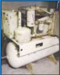
10 HP Gardner-Denver Rotary Screw Horizontal Tank Air Compressor

A 12% BUYER'S PREMIUM IN EFFECT FOR THIS SALE.