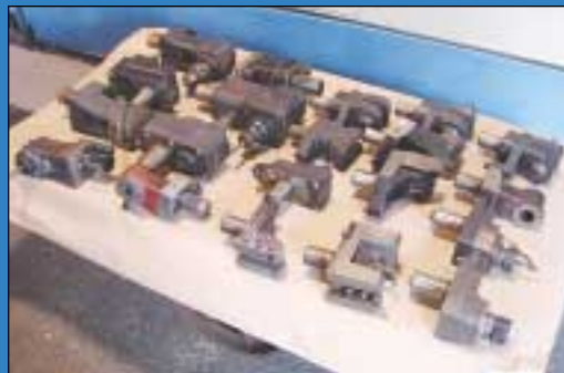
Partial View Standard and Live Toolholders for Mazak CNC Lathes

21" Cincinnati Bickford Sliding Head Drill; 16" X 21" Table (Building 2)