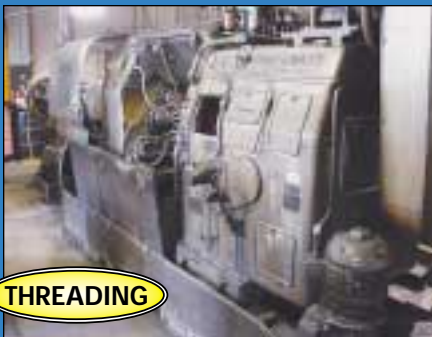
1" Acme-Gridley Model RA-6 Six-Spindle Automatic Bar Machine