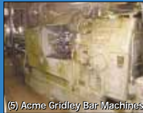
(5) Acme Gridley Bar Machines