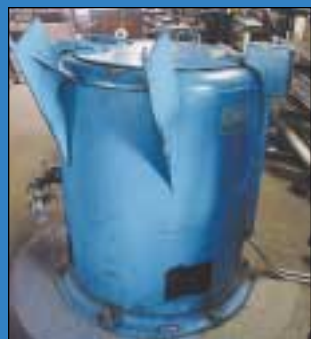
Barrett Centrifugals Chip Spinner