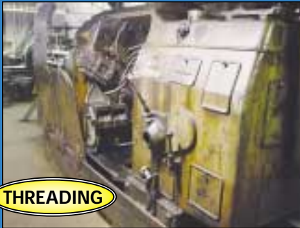
1-5/8" Acme-Gridley Model RA-6 Six-Spindle Automatic Bar Machine