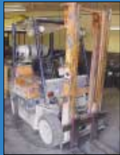
5,000 LB Toyota Model 5FG25 LP Gas Solid Tire Forklift