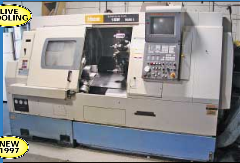
Mazak Super Quick Turn Model 15M Mark II Three-Axis Slant Bed CNC Turning Center