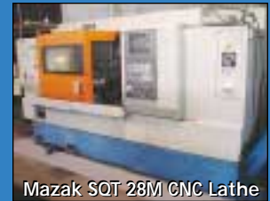
Mazak SOT 28M CNC Lathe