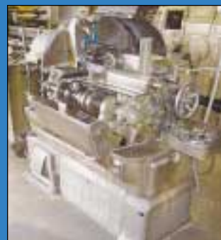
(2) 1-1/4" Brown & Sharpe No. 26 Single Spindle Automatic Screw Machines