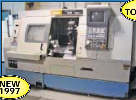
Mazak Super Quick Turn Model 15MS Mark II Three-Axis Slant Bed CNC Turning Center