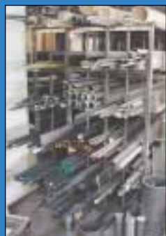
Partial View Raw Material Inventory