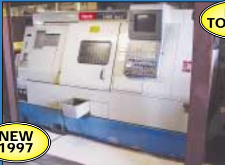
Mazak Super Quick Turn Model 28M Three-Axis Slant Bed CNC Turning Center