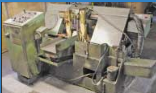
10" X 12" DoAll Model C-260A Automatic Horizontal Band Saw

Raw Material Consisting of; Brass & S.S. Bar Stock, Steel Flat Stock, Bar Stock, Tubing, Hex Stock, Pipe, Angle Iron, Beam Material, & Other Related Items