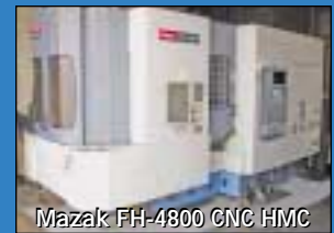
Mazak FH-4800 CNC HMC