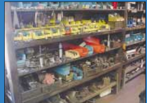
Partial View Large Quantity Acme Gridley Tooling