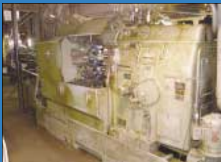
1-5/8" Acme-Gridley Model RBN-8 Eight-Spindle Automatic Bar Machine

Featuring: Mazak Model FH-4800 Four-Axis Two-Pallet CNC HMC (New 2000), Mazak SQT Models 28M, 15MS, 15M, & 10MS Three-Axis CNC Turning Centers (New As 1997), Live Tooling, LNS & SMW Bar Feeds, (5) Acme-Gridley Automatic Bar Machines, Screw Machine Tooling, (3) Bridgeport Vertical Milling Machines, DoAll C-260A Horizontal Band Saw, (3) Covell Surface Grinders, Myford OD Grinder, (3) 1/2 Ton Jib Cranes, Lift Truck, (2) Chip Spinners, Perishable Tooling, Machine Accessories, & Shop Equipment